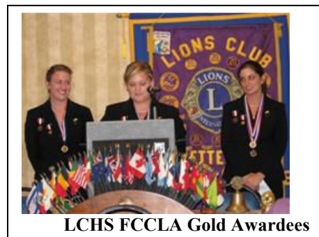
LCHS FCCLA Gold Awardees